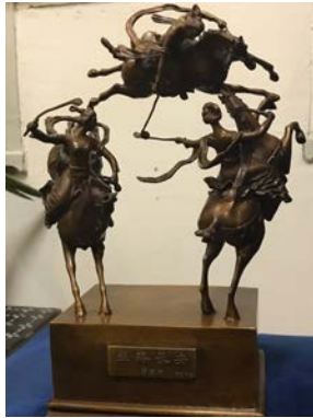
Silk Road Monument