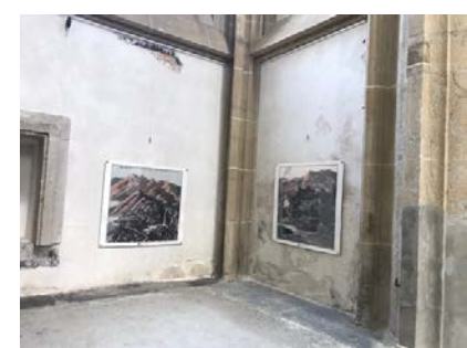
St. Nicholas Church, Kampen